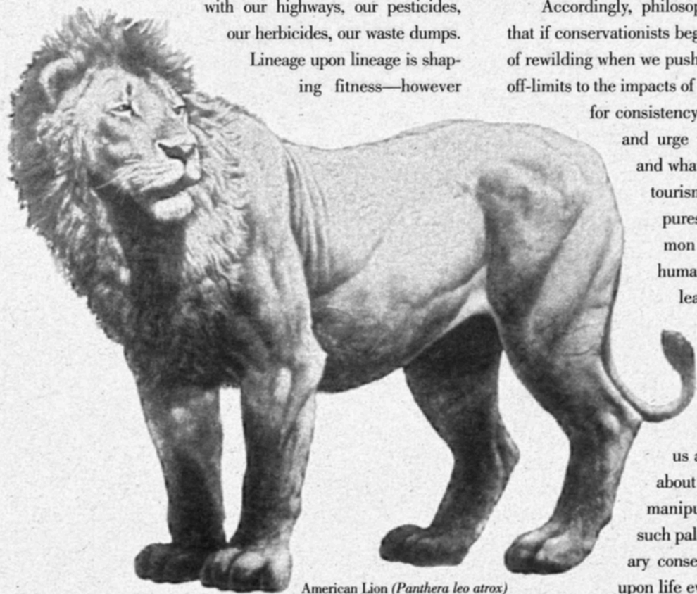
American Lion ( Panthera leo atrox )