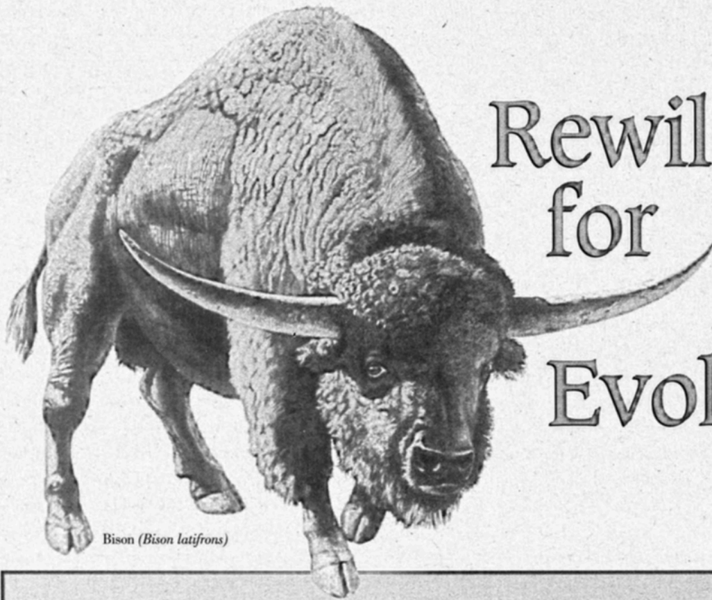
Bison ( Bison latifrons )